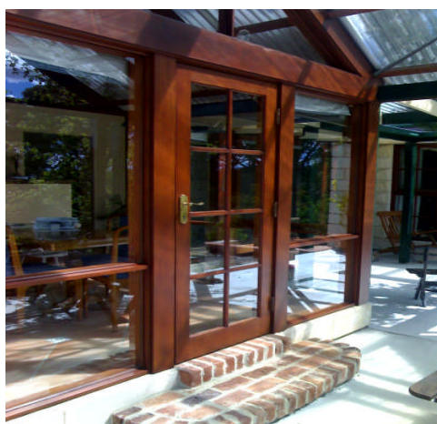
VOLVOX ProAqua Wood Transparent Finish Mahogany

VOLVOX ProAqua Transparent Wood Finish is V.O.C. free, water based, non-drip, and long lasting wood finish for interior and exterior use. Available in transparent wood colours of Natural (exterior only) Clear (interior only), Pine, Walnut, Oak, Mahogany, Teak, White, Ebony, Citrus, Yellow, Corn Yellow, Oriental Red, Meadow Green and Mondrian Blue. The ProAqua Clear can be tinted to match your individual colour scheme. A full colour chart and product list is available upon request